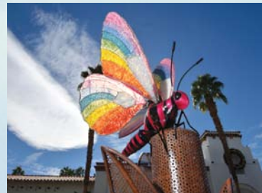
Fluttering Rainbow by Stephen Fairfield, 2017/2018 El Paseo Exhibition