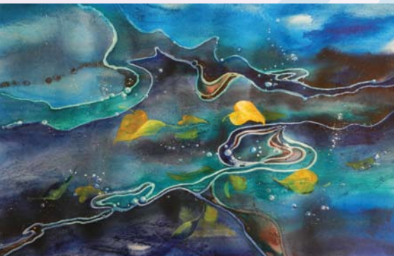
Creekside by Sylvia Smith

The Palm Desert Community Gallery's new exhibition features artwork from the artists of, ART on the EDGE , on display January 19 to March 30. A public reception will honor the artists on Monday, January 23, from 5:30 to 7 p.m.